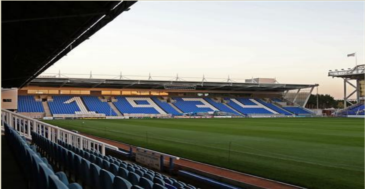
New Moy End (Motorpoint Stand)

The Palmerston Arms at 82 Oundle Road The range of beer, using several from Bateman's , together with several from the local area as well as two from Manchester (Oldershaw's & Phoenix) and one from Newcastle (Mordue), was superb. It has along with staffs that are easy going, pleasant and efficient and the beer is gravity fill and taste better for it. Going there follow the directions to the ground instead of taking a left to the ground take a right into Oundle Road walk past the Cherry Tree to the Palmerston and its 300yards back to the ground.