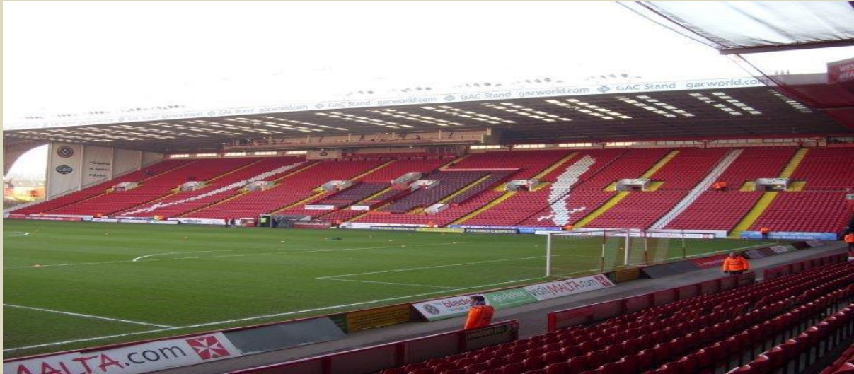
South Stand (Dan 92)

Both sides of the ground are large single tiered stands. Whilst the GAC (South) Stand is a fairly plain looking stand, the North Stand (Visit Malta Stand) which sits opposite, and this stand which was opened in 1996, has had the corners to either side of it filled in, by offices on one side and a family seated area on the other, called the Fortina Spa Corner, in a corporate sponsorship deal.