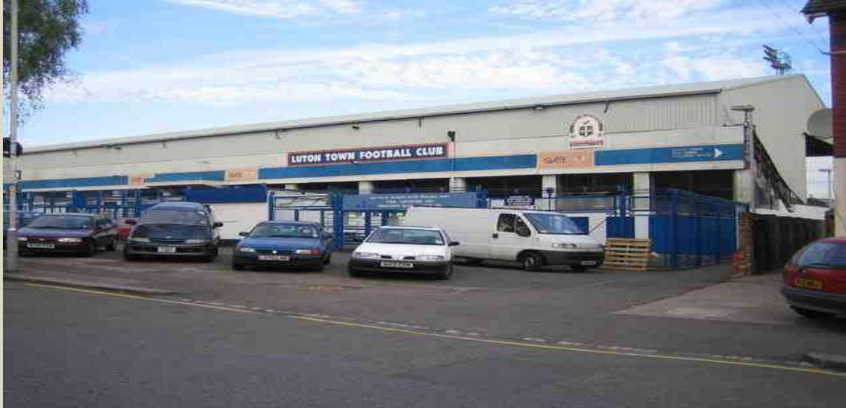
Kenilworth Road Entrance

Leave the M1 at Junction 11 take the A505 exit to Luton/ Dunstable towards Luton. At the roundabout, take the 1st exit onto Dunstable Rd continue down the road to the lights then take a left and then a right into Leagrave Street which merges into Dunstable Road then take the third on the left into St Francis Street and then first right into Sainsbury car park don't exceed 3 hours or you will get a ticket and from there it's only 4 minutes' walk up to the ground.