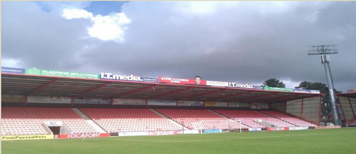
Steve Fletcher Stand

Away fans are located on one side of the Energy Consulting East Stand, which is situated at one side of the pitch. The normal allocation for this area is 1,500 seats, but this can be increased to 2,000 if required. The stand is shared with home supporters and offers a good view of the playing action. The facilities are okay a normally there is a good atmosphere.