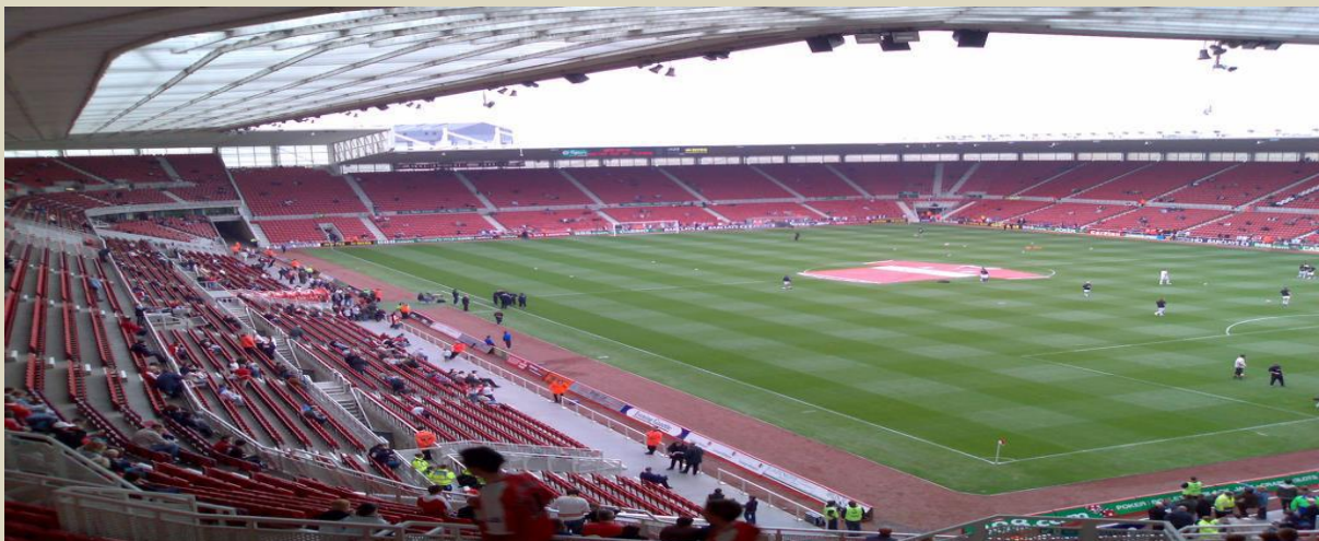
West and North Stands

Away supporters are housed on one side of the East Stand (towards the South East corner) at one side of the stadium and just under 3,000 fans can be accommodated in this area. The turnstiles are electronic which means that you have to insert your ticket in a reader, to gain entry. The away turnstiles are numbered 53-61 and then there is the regular fayre of food; Cheeseburgers (£3.80), Burgers (£3.50), Hot Dogs (£3.50), Pizza (£3), Chicken Balti Pies (£3), Cheese & Onion Pasties (£3) and Minced Beef Pies (£3). If you head over to the local shopping Centre then go to Copelands there selection of food and bakery are the cheapest in the town and get you coffee from Muffins in the Centre.