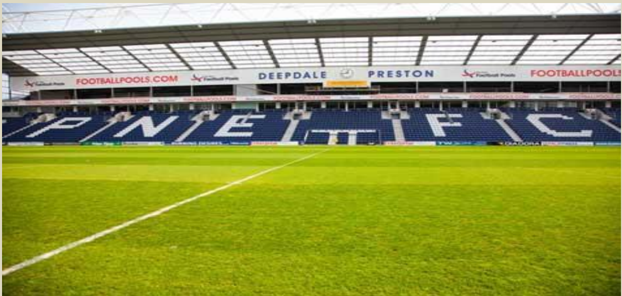
The Invincible Stands

The first of these stands to be built was the Sir Tom Finney Stand in 1995. This was followed by the Bill Shankly Kop in 1998 and the Alan Kelly Stand in 2001 and complete and they are of the same height and style and are all large, covered, single tiered stands. Up to 6,000 away fans are accommodated in the Shankly Kop end of the ground and the club have a good deal for away fans of £48 for two adults plus two under 16's saving a family £20 on the day.