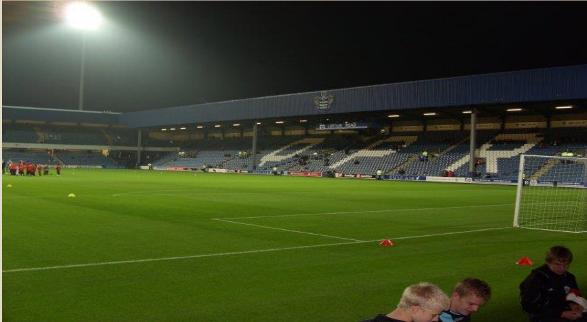
Ellerslie Stand (Dan 92)

Loftus Road has a tight compact feel, enclosed, with supporters being close to the pitch. An unusual aspect is that all four stands are roughly the same height, their roofs meet at all four corners with no gaps. The pre 1991's ground was open to the elements on three sides.