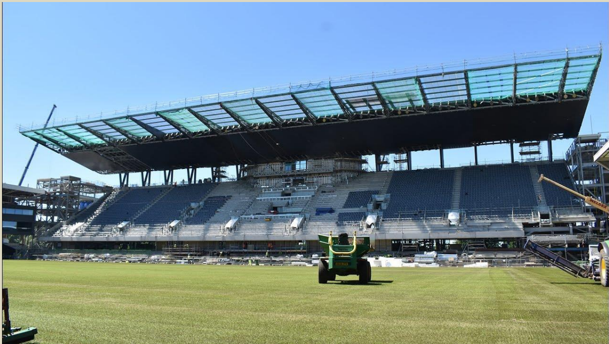
The Riverside End

Fulham Park Garden or Danish Pastries on Munster Road