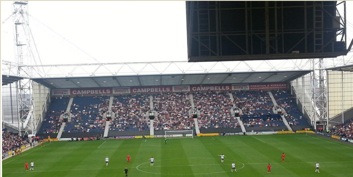
Allan Kelly Stand

However, in 2010 the museum was controversially closed, to be relocated to Urbis in Manchester, where it reopened in 2012. The move prompted Sir Tom Finney to withdraw his personal memorabilia from the museum in protest.