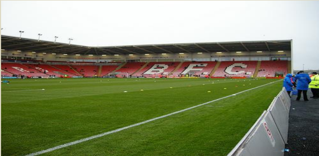
Stan Mathews and North Stand

Outside the stadium, behind the North Stand is a statue of the former Blackpool legend Stan Mortensen, whilst outside the main entrance is a statue of Jimmy Armfield.