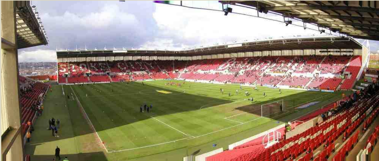
South & East Ends

The Club moved to the Britannia Stadium 1997, after playing for 119 years at their old Victoria Ground which had been the original ground as Stoke Ramblers when it had been Victoria Cricket Ground in 1862 and you walk past this piece land to get to the ground.