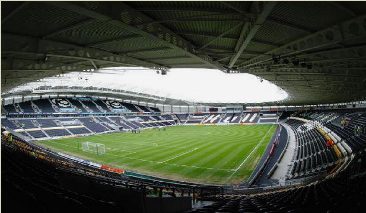
All four stands

Built in a parkland setting, the stadium is totally enclosed and only 100 yards from their original Anlady Road Cricket Ground, with the West Stand being around twice the size of the other three sides. Apart from the West Stand, each of the other three stands is single tiered. The West Stand also benefits from having a row of executive boxes running across its middle. There is a large video screen at the North End of the stadium and the P.A system within the stadium is also excellent.