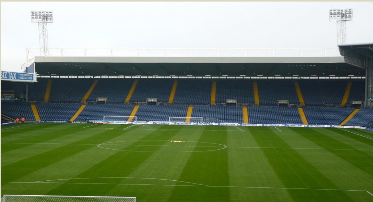
Birmingham Road Stand

In between the East Stand & Birmingham Road End you will notice perched up on a wall, a large Throstle (the clubs emblem) standing on a football. This has been kept over from the previous stand it used to sit above the clock on the half time scoreboard and maintains the links with tradition.