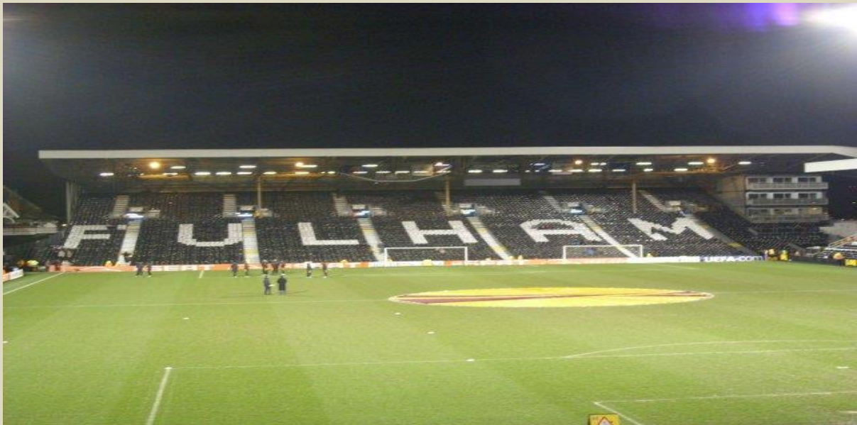
The Putney End

An unusual feature is that the teams enter the field from one corner of the ground at the Pavilion (The Cottage) and then make their way up onto the pitch as it is raised. There is a small electric scoreboard situated above the Putney End and outside the stadium alongside Stevenage Road is the Johnny Haynes Statue.