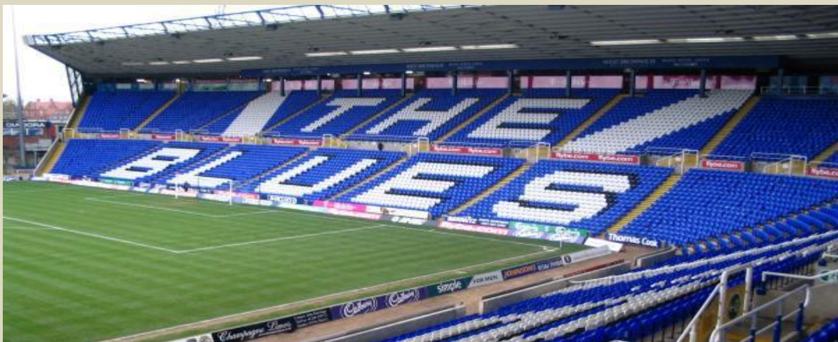
Spion Kop End

After the Hillsborough Disaster in Sheffield three quarters of the ground was rebuilt in the mid 90's. One large two-tiered tiered stand, incorporating the Tilton Road End and the old Spion Kop end, completely surrounds half the pitch and replaced a former huge Spion Kop terrace.