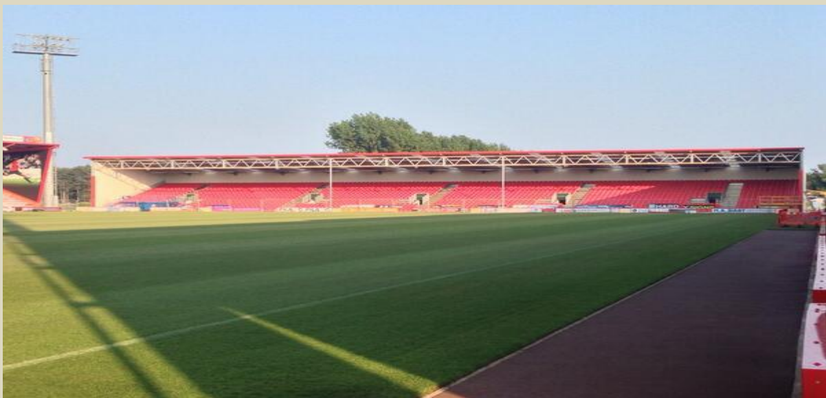
Ted McDougal Stand

The stadium has been greatly improved with the addition of the Ted MacDougall Stand at the South End of the stadium. Although temporary in nature, the stand which is named after a former centre forward, and was erected in the Summer of 2013. Having a capacity of 2,400 seats with the only drawback is the couple of supporting pillars which block the view.