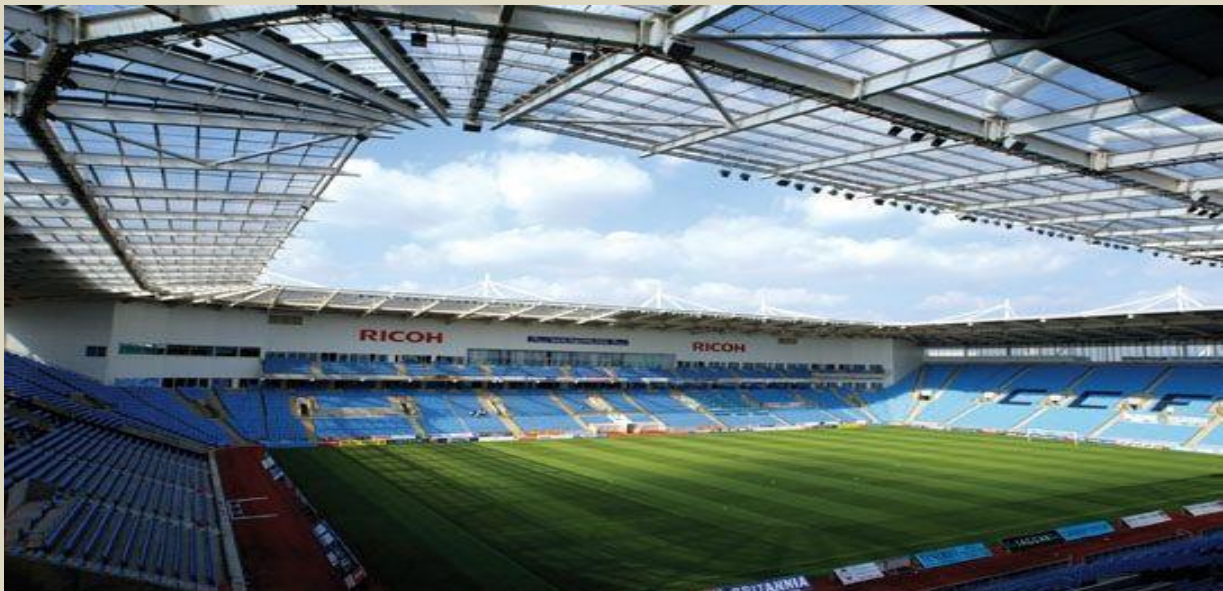
South, West and North Stands

The Lloyds Pharmacy Stand, it has a small tier of seats overhanging the larger lower tier, with a row of corporate hospitality boxes, running along the back of the lower section. Along the top of the stand is a large area of white panelling (adorned with the logo of the stadium sponsors) that runs along the length of the stand and around the corners of either side of it. In one of these corners is located a Police Control box. Below the white panelling is a large windowed corporate hospitality area.