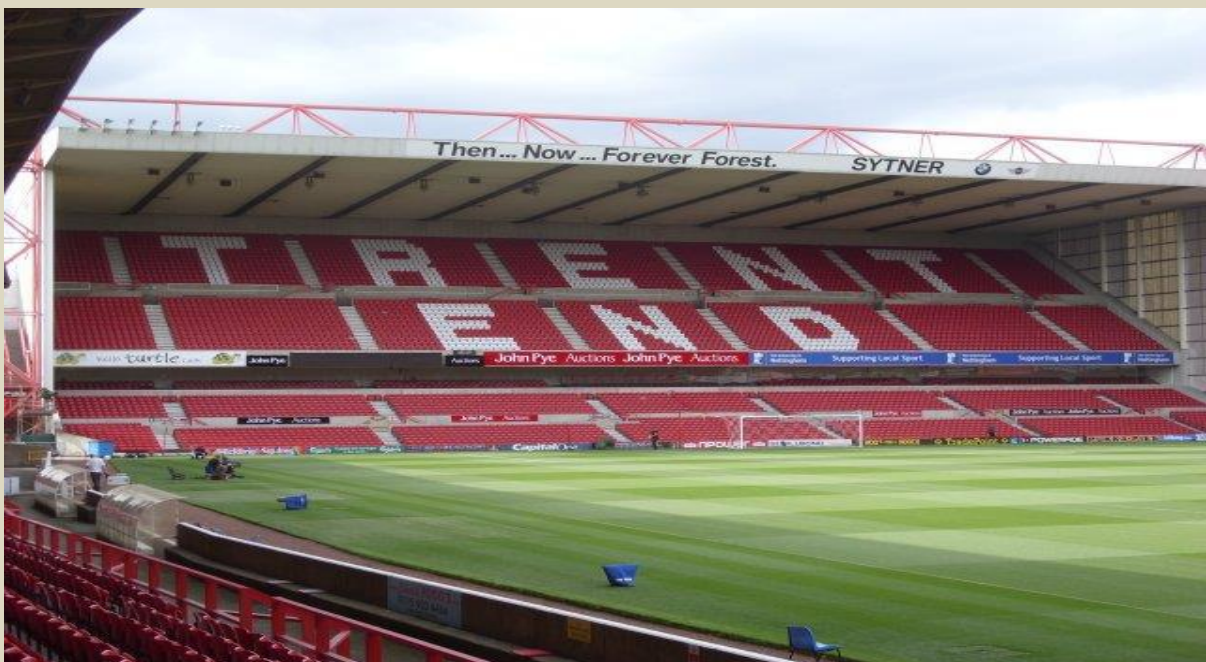
Trent End (Dan)

At one end, the Bridgford Stand houses away fans in the lower tier up to 4,500 away fans are accommodated but do not use the front few rows when raining you will get very wet, to get there is to go through the car park via Scarrington Road of Lady Bay Bridge with the corners filled in between it and the Brian Clough Stand.