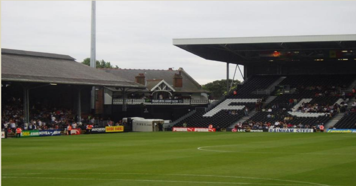
The last football pavilion

Opposite the main Stand is the aptly named Riverside Stand. With its back to the banks of the River Thames, this all seated, covered stand was opened in 1972. It also has a row of executive boxes running across the back of it and also houses a television gantry and it has a couple of supporting pillars.