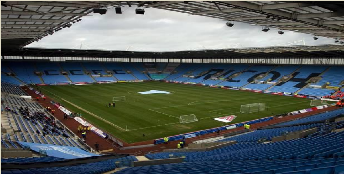
South & East Stand

The Lloyds Pharmacy Stand, it has a small tier of seats overhanging the larger lower tier, with a row of corporate hospitality boxes, running along the back of the lower section. Along the top of the stand is a large area of white panelling (adorned with the logo of the stadium sponsors) that runs along the length of the stand and around the corners of either side of it. In one of these corners is located a Police Control box. Below the white panelling is a large windowed corporate hospitality area.