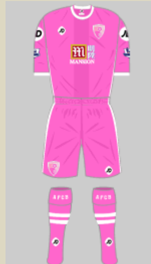
Away Alternative (Breast Cancer)