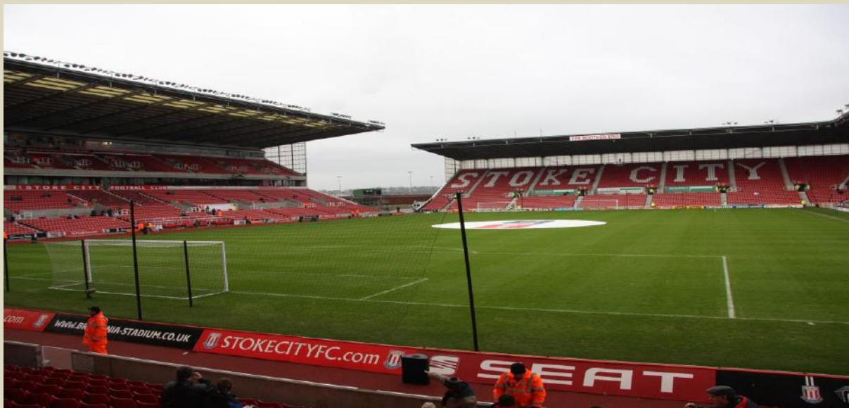
East & West Main Stand

At the Boothen End there are three statues of the legendary former player Sir Stanley Matthews, which were originally unveiled by Kevin Keegan'. The club also have a couple of unusual looking mascots, with a blue coloured hippo called 'Pottermus' and his white girlfriend 'Pottermis' as bad as Man City and MK Dons.