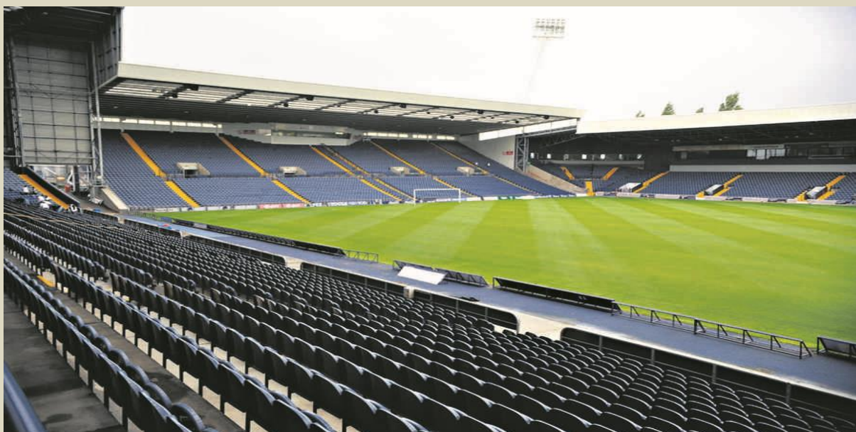
Smethwick Road End