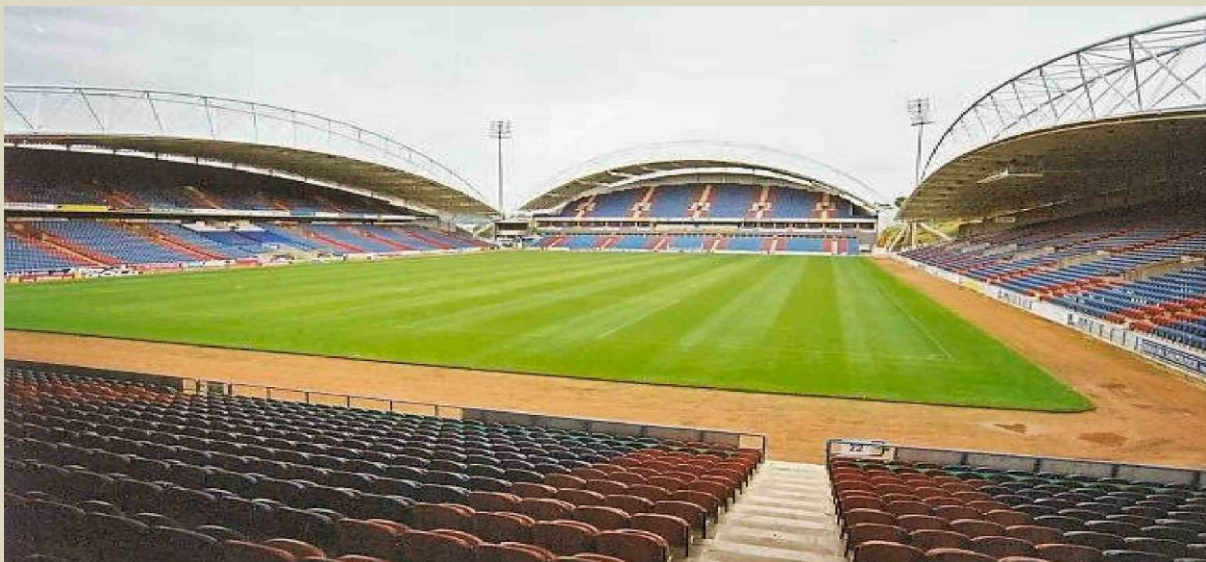
North Stand, East and West Main Stand from the South Stand

The Media North Stand at one end and the Riverside Stand at one side are both two tiered stands, each with a row of executive boxes running across the middle. The other two sides of the ground are large single tiered affairs. One of these the Britannia Rescue Stand, at one side of the pitch, can accommodate 7,000 supporters. There is an electric scoreboard at the back of the away end in the South End of the ground known as the Pink Lane Stand which can accommodate up to 4,000 away fans with the stadium is shared with Huddersfield Giants Rugby League Club. Food on offer inside the stadium includes; Cheeseburgers (£3.50), Hamburgers (£3.20), Hot Dogs (£3.20), Peppered Steak Pie (£3.50), Meat and Potato Pie (£3.50), Chicken Balti Pie (£3.50), Cheese and Onion Pie (£3.50) and Sausage Rolls (£3). But go the Pound bakery at 60 New Street the pies are cheaper and for a good coffee go Coffee revolution at 8 Church Street you will save money for drinks.