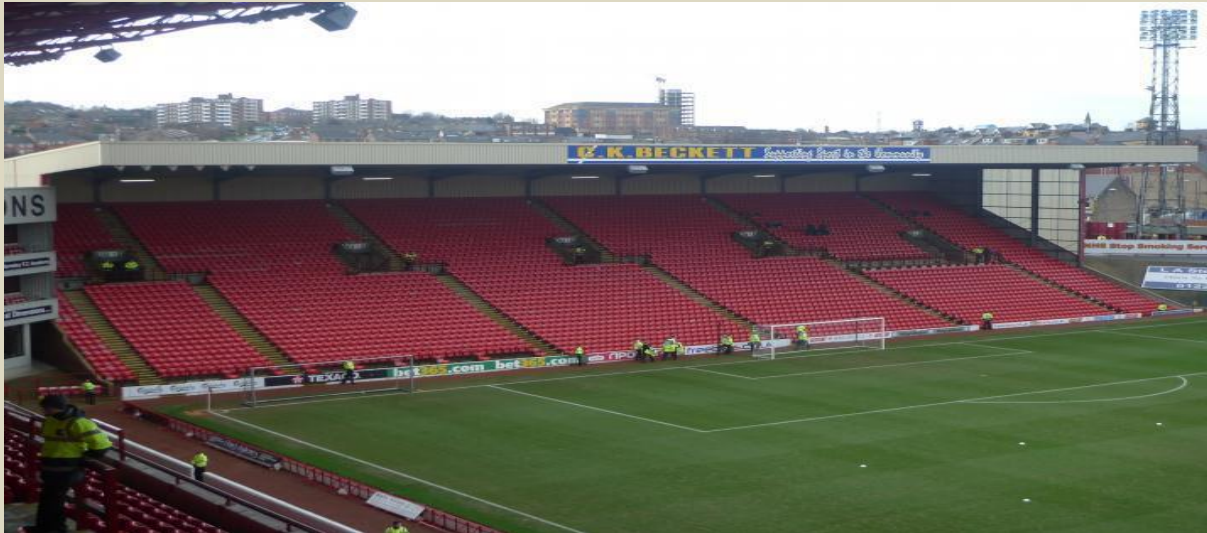
Pontefract Road End

A good feature of the stadium is a purpose built stand for disabled supporters as there is a three floor structure that sits at the corner between the East & South Stands which gives them great views of the match. There is also an electric scoreboard at one corner of the North Stand, on top of a security control room. The teams come out from one corner of the ground between the North and West Stands.