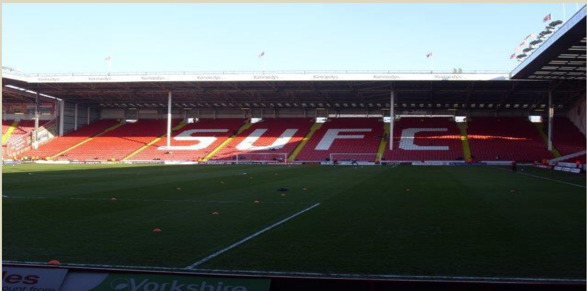
The Kop End (Dan 92)

Both sides of the ground are large single tiered stands. Whilst the GAC (South) Stand is a fairly plain looking stand, the North Stand (Visit Malta Stand) which sits opposite, and this stand which was opened in 1996, has had the corners to either side of it filled in, by offices on one side and a family seated area on the other, called the Fortina Spa Corner, in a corporate sponsorship deal.