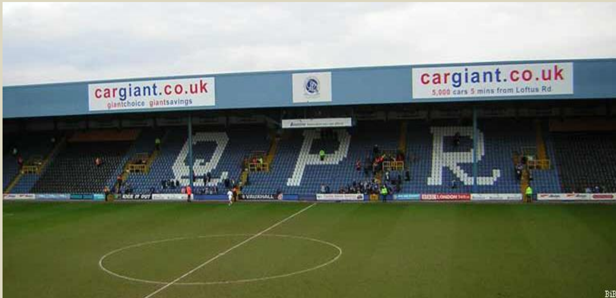
Loftus Road Stand

On one of these, the School End where the away fans are situated in the upper tier of the stand, where around 2,500 fans can be accommodated. If demand requires it then the lower tier can also be allocated. If the away club only takes the upper tier allocation, then the lower tier is allocated to home supporters. The entrance for away fans to the School End upper tier is now longer in South Africa Road, but on the opposite side of the ground in Ellerslie Road and there is a large video screen located on the centre of its roof.