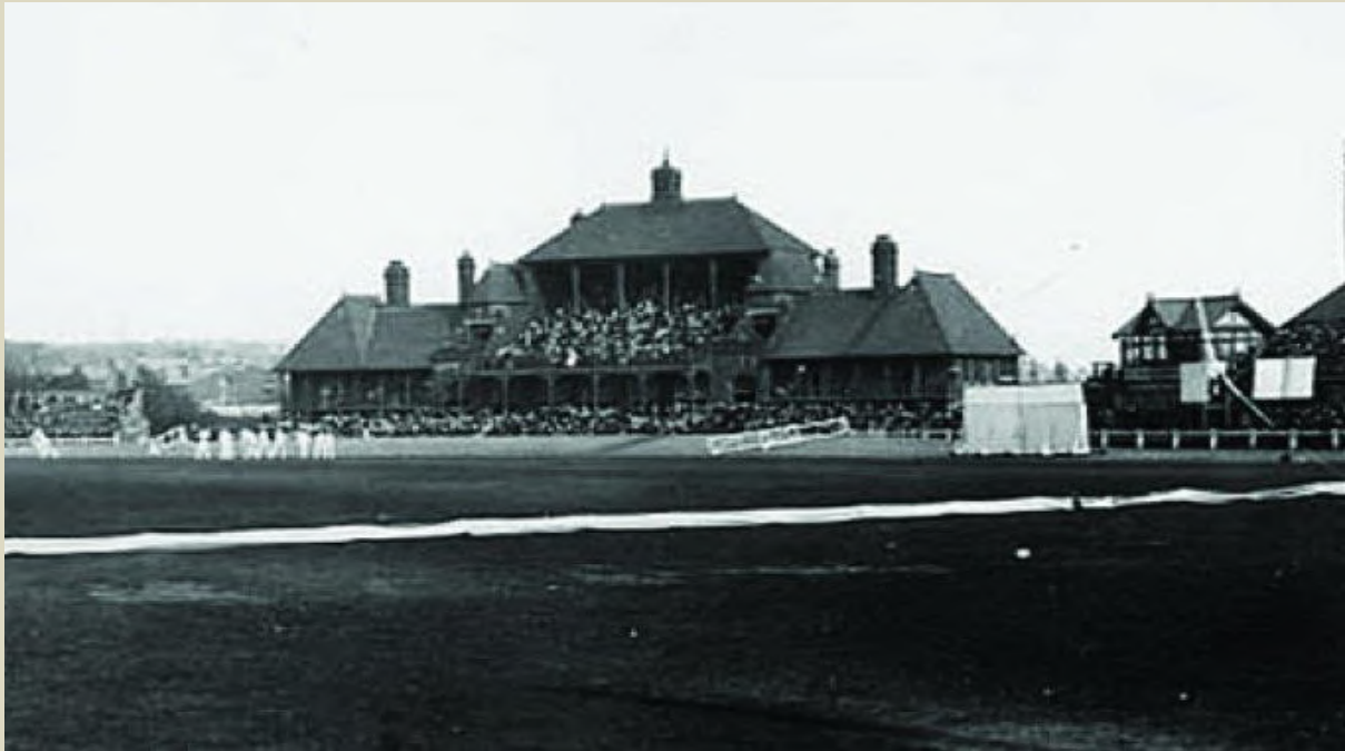
Former South End Stand (Pavilion End)