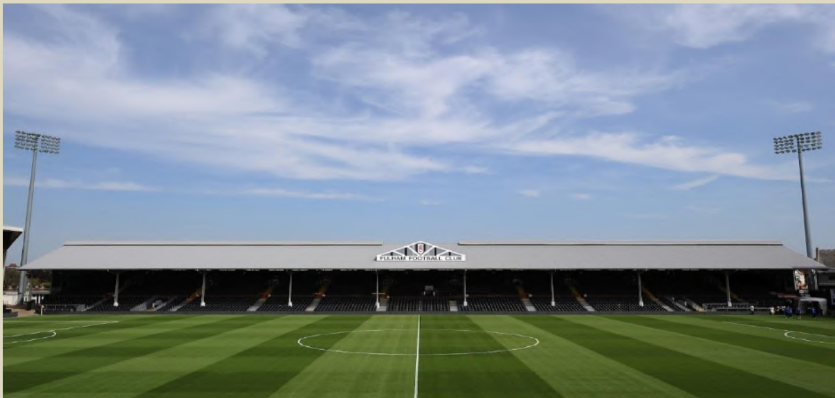
Jonny Hayes Stand

Opposite the main Stand is the aptly named Riverside Stand. With its back to the banks of the River Thames, this all seated, covered stand was opened in 1972. It also has a row of executive boxes running across the back of it and also houses a television gantry and it has a couple of supporting pillars.