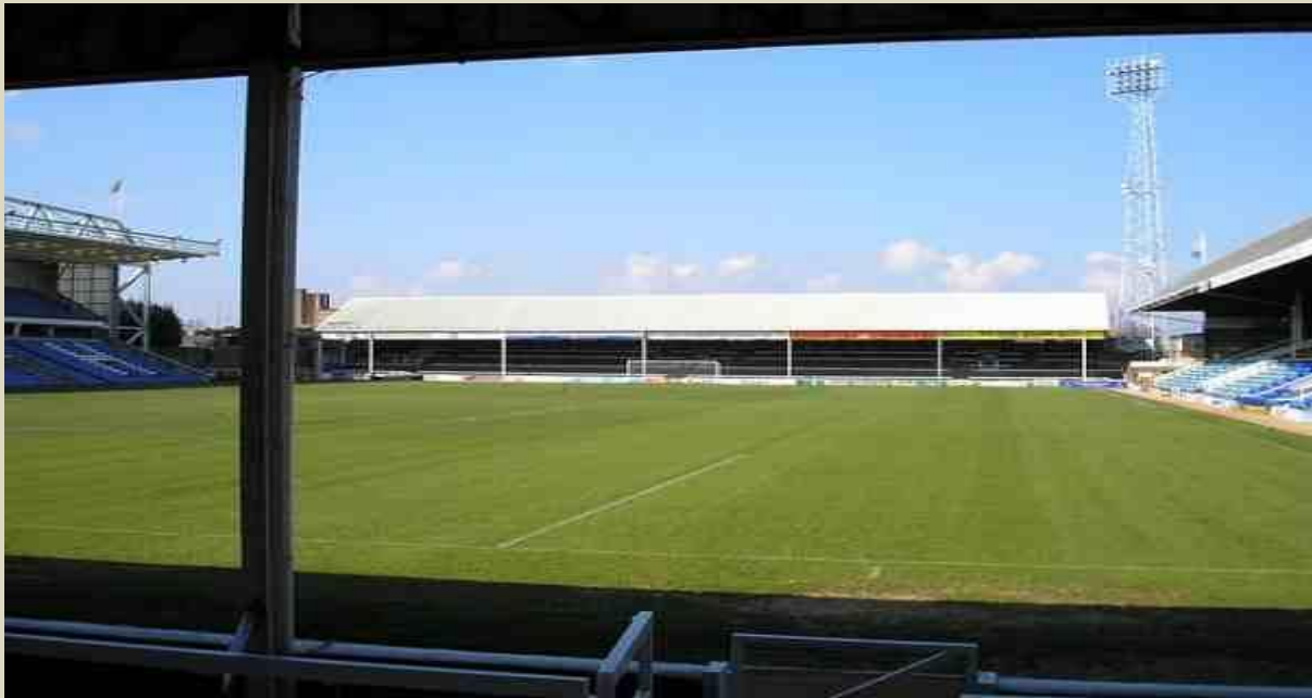
London Road End

Road A563 and continue up to Palmerston roundabout then take a left onto A6 follow the road to the Garby Hotel at the cross roads and take a left the at the roundabout take the first exit then at the lights at the cross road at the Hong Kong restaurant (On your right) take the signs for Peterborough A41 and at junction 15 exit the A47 and at the roundabout take the third exit onto Nene Parkway and then take the second exit onto Oundle Road then at the junction just after the railway bridge go straight on down to the ground.