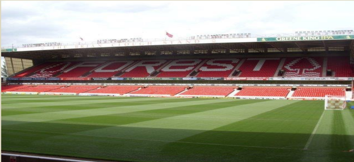
Brian Clough Stand

At one end, the Bridgford Stand houses away fans in the lower tier up to 4,500 away fans are accommodated but do not use the front few rows when raining you will get very wet, to get there is to go through the car park via Scarrington Road of Lady Bay Bridge with the corners filled in between it and the Brian Clough Stand.