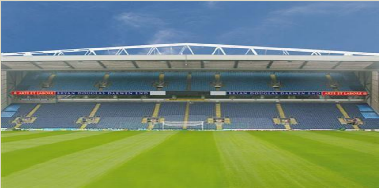
Bryan Douglas Stand

good but the spacing between the rows of seats being quite tight (designed for a midget). The Darwen End is shared with home supporters, but if demand requires it the whole of the stand can be made available with 4,000 tickets, which are split between the whole of the upper tier and part of the lower tier (with the lower tier being allocated first).