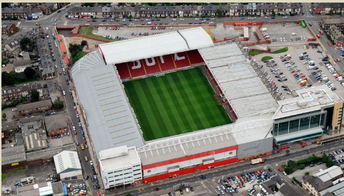
The cricket ground is now part of the car park behind the south stand on the right