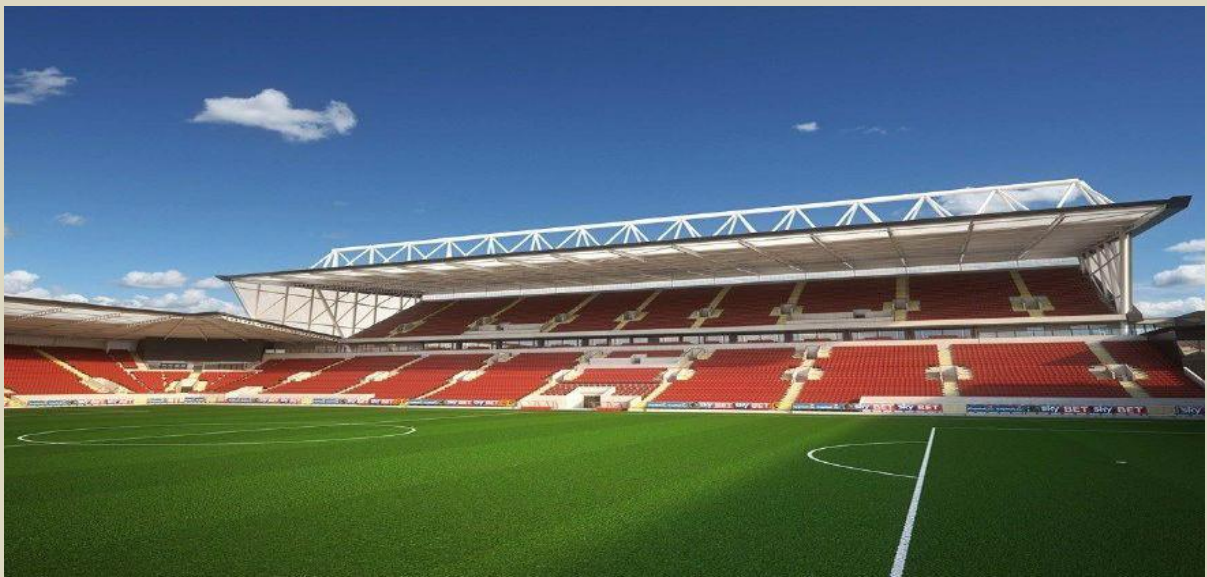
Updated Main Stand

It has a large lower tier, with a smaller one above, whilst in-between the tiers there is a row of corporate boxes stretching across its middle. The stand has quite a high roof with a strip of Perspex running across the top of the upper tier just below, to allow more light to get to the pitch.