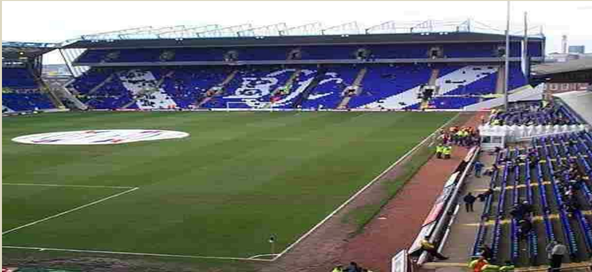
Gil Merrick Stand

The Railway End, recently renamed Gil Merrick Stand their appearances record holder of 551 between 1946 to 1960 was opened in February 1999. It is a large two tiered stand and unusual in having quite a small top tier, which overhangs the lower area. Again there is a row of executive boxes in this stand, housed at the back of the lower section.